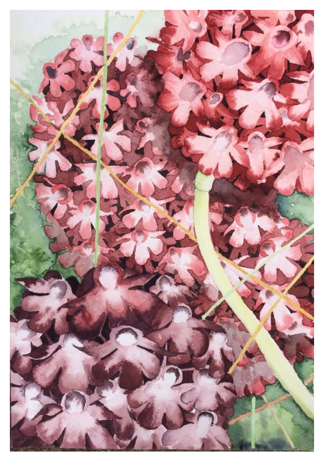
Early purple orchid - watercolour I spotted one of these on Minch Common and was intrigued by the sculptural shape of the flowers.